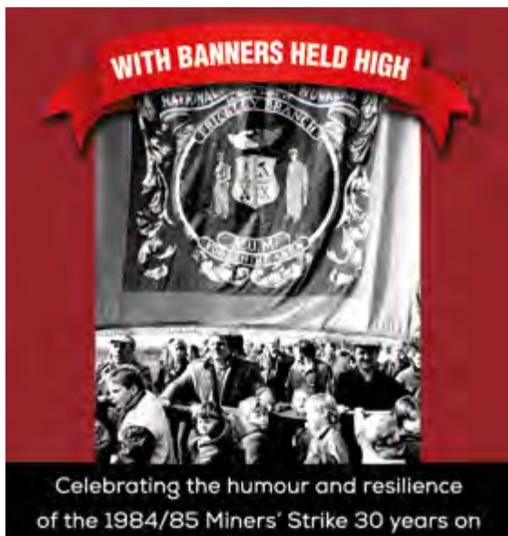
Celebrating the humour and resilience of the 1984/85 Miners' Strike 30 years on