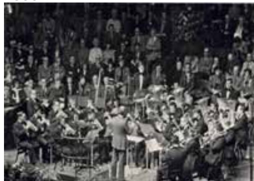
The British Open

Whilst the gentry of the day enjoyed opera, theatre and ballet, working people loved to hear the stirring sounds of a British brass band, with over 16,000 spectators attending at the first ever British Open Brass Band Championships, Belle Vue in 1853.